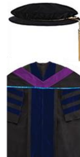
Doctor of Education

A black robe with zipper and dark blue velvet facings down each side in the front; the gown has bell-shaped sleeves with three dark blue velvet strips; black hood trimmed with purple velvet lining at the inner edge and with blue silk lining throughout, the lining being turned over to the depth of 1 cm; the length of the hood is four feet; black bonnet bounded with golden-yellow cord and tassel.