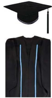
Postgraduate Diploma in Education