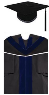
Master of Philosophy

A black robe with zipper and dark blue velvet facings down each side in the front; the gown has bell-shaped sleeves; black hood trimmed with dark blue velvet lining at the inner edge and with silver silk lining throughout; the lining being turned over to the depth of 1 cm; the length of the hood is three and one-half feet; black mortar-board cap with black braid and tassel.