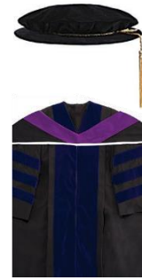
Doctor of Philosophy

A black robe with zipper and dark blue velvet facings down each side in the front; the gown has bell-shaped sleeves with three dark blue velvet strips; black hood trimmed with purple velvet lining at the inner edge and with silver silk lining throughout; the lining being turned over to the depth of 1 cm; the length of the hood is four feet; black bonnet bounded with golden-yellow cord and tassel.