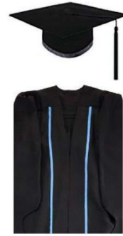
Postgraduate Diploma in Education