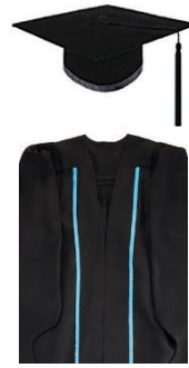
Postgraduate Diploma in Education